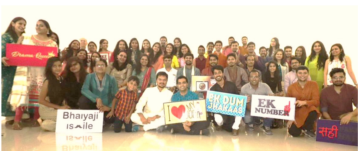
Vadodara team posing with photo tags