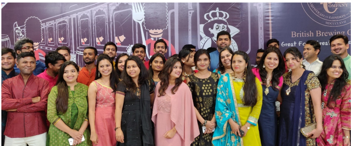
Pune team outside Maharaja Bhog