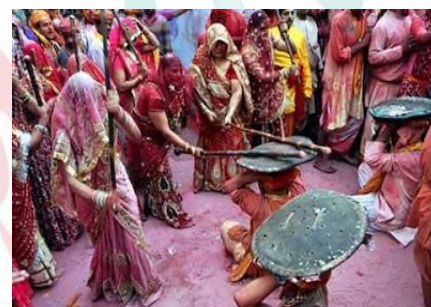
Figure 3: Source- krishnablogspot

Interestingly, the festival here is celebrated with not just colours, but with lathis or sticks. As per tradition, women chase away the men with lathis while men sing songs to invite the attention of women. But it's not a beating session. The men come prepared to protect themselves with shields.