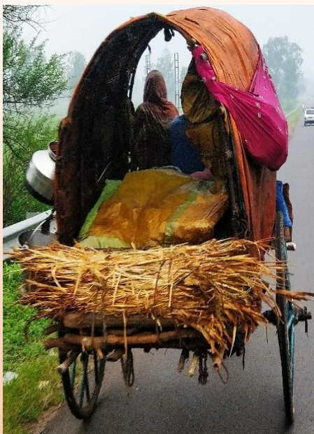
Bullock Cart - A mode of transport in rural India