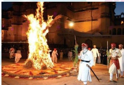
Figure 6: Source- mediaindia