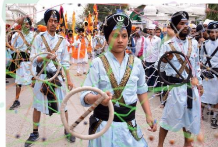
Figure 1: Source- huffingtonpost

Hola Mohalla, known as the warrior Holi, is celebrated in Punjab. This festival is observed by Nihang Sikhs. They exhibit martial arts, and sing their hearts out on this day, that is usually celebrated a day before Holi.