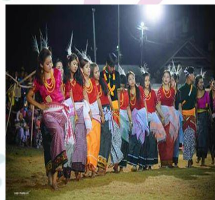
Figure 5: Source- kumhei

Yaosang is a festival celebrated in Manipur for five days and is considered the most important festival in Manipur. The highlight of the festival is the Thabal chongba, a Manipuri folk dance that is performed during Yaosang. It begins just after sunset in every village with Yaosang Mei thaba or burning of the straw hut after which monetary donations are given to children. This tradition is called nakatheng. On the second and third days, girls go to their relatives for their nakatheng and block roads with ropes for collecting money. On fourth and fifth days, people pour or splash water on one another.