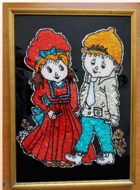
Artistic Creation by Siddhi Oak , Business Analyst